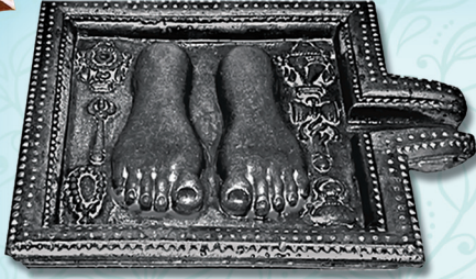
Pious Lotus Feet of Sripada Srivallabha

Sri Datta Sharanam Mama Sripadarajam Sharanam Prapady Sridharaya Namonamaha